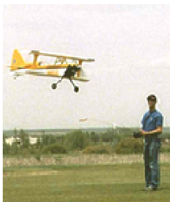
Stony Plain, Alberta

“A non-profit Organization dedicated to the building and flying of model aircraft”